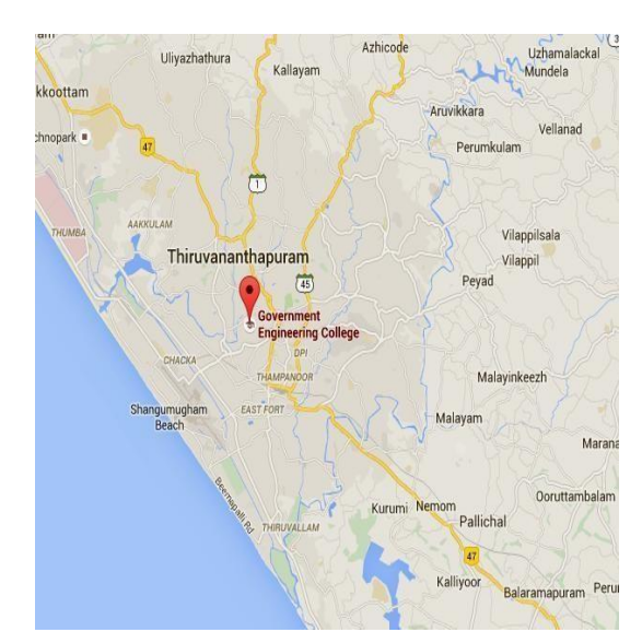
Location of the institution in map

Phone number with STD code 0471-2300484, 2300485